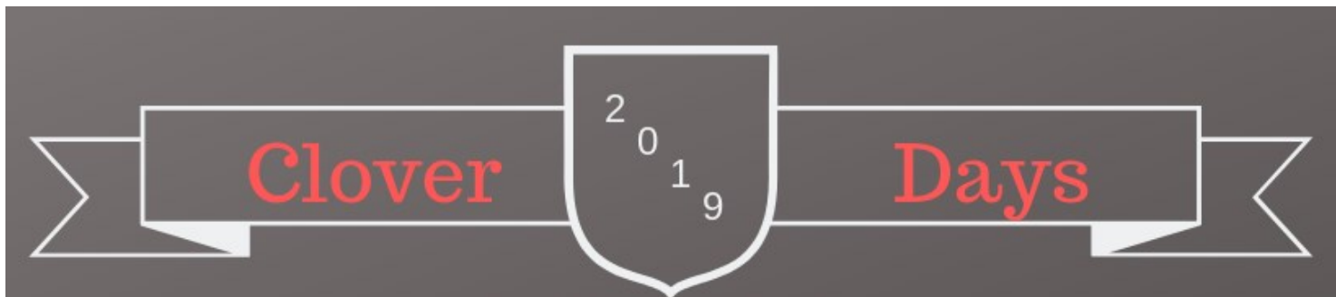
JOIN US FOR